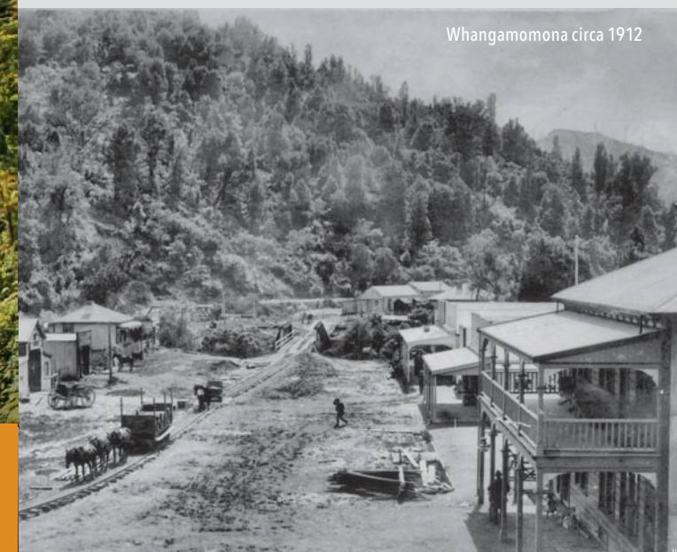
Whangamomona circa 1912